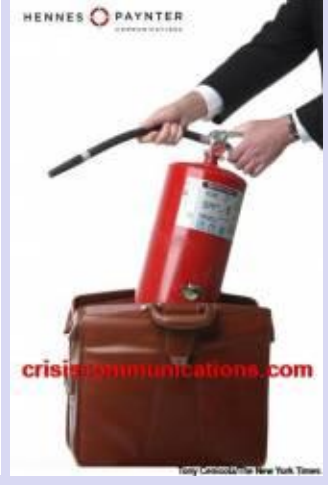
Association on 12/20.

Are you looking for an eye-opening, inspiring presentation for your next event? If your organization, company or association is searching for something different—a content-packed, entertaining, how-to customized seminar on how to manage the media - then we should talk. Don't just take our word for it. See what other people say about our seminars.